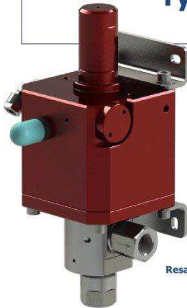
Resato P80 mini pump

Resato's new mini pump is available in four pressure ranges up to 1800 bar at 7 bar air drive pressure and 2500 bar at 10 bar air drive pressure.