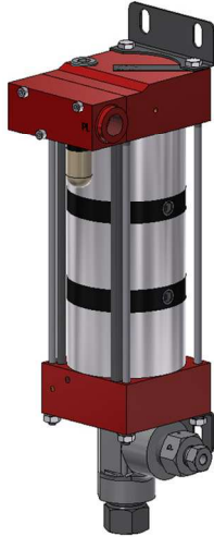
M189-3 (L) single acting, tripple air drive head (Standard= Bottom inlet)