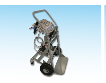
Electric Driven Booster Packages 2-Bottle Hand Truck with Booster